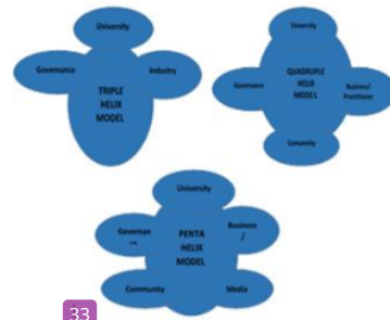
33 Figure 1. Model of Triple Helix, Quadruple Helix, and Penta Helix

According to the Triple Helix model, innovation is driven by mutual interactions and collaborations among the three helices. Academic institutions generate new knowledge through research and education, the industry applies this knowledge to develop new products and services, and the government provides the framework and support for these activities to take place.