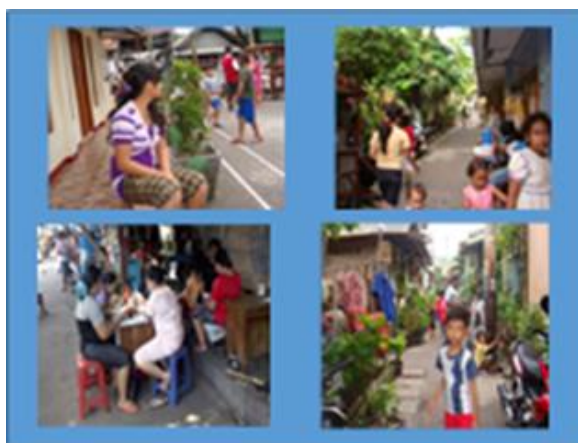
Figure 2. Several activities took place in the corridors of the urban kampong

As can be seen in Figure 2, the role of the community in the formation of the creative economy on the small road is based on the creativity of the residents and culture, the apparatus there without any interference from the government or other elements.