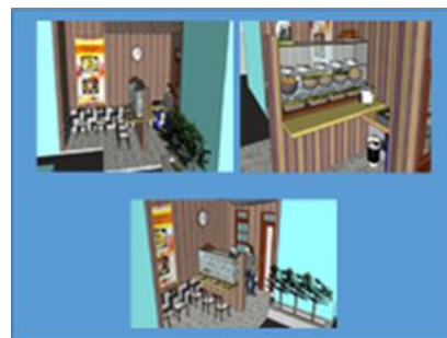
Figure 4. Before rearranging the business space Figure 5. After rearranging the business space