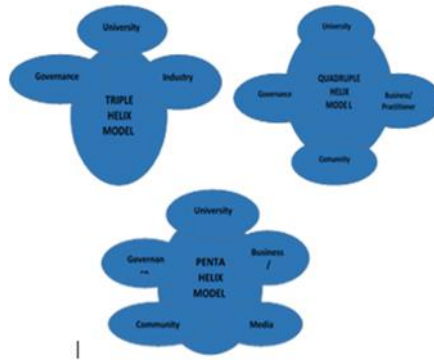
Figure 1. Model of Triple Helix, Quadruple Helix, and Penta Helix

According to the Triple Helix model, innovation is driven by mutual interactions and collaborations among the three helices. Academic institutions generate new knowledge through research and education, the industry applies this knowledge to develop new products and services, and the government provides the framework and support for these activities to take place.