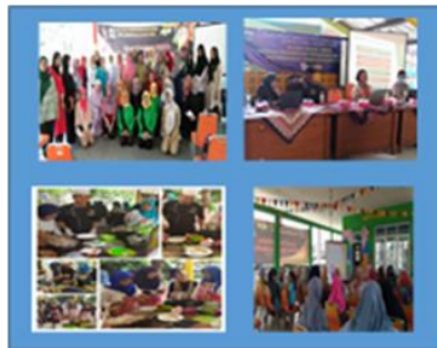
Figure 3. Implementation of Integrated Entrepreneurship Program

This activity is beneficial for low-income communities in urban Kampong in the Paseban area of Central Jakarta; limited knowledge, capital, and infrastructure can be minimized through the Integrated Entrepreneurship Program (PKT). The collaboration of all parties can support the one-stop program that has been socialized by PTSP as an agency created by the Regional Government of DKI. This activity is expected to meet the targets that have been made and can be achieved through a continuous coaching process with monitoring and evaluation that already uses a system so that all supporting and inhibiting elements can be optimally detected.