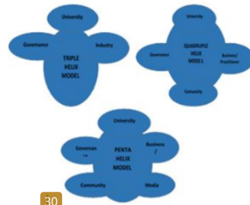
30 Figure 1. Model of Triple Helix, Quadruple Helix, and Penta Helix

According to the Triple Helix model, innovation is driven by mutual interactions and collaborations among the three helices. Academic institutions generate new knowledge through research and education, the industry applies this knowledge to develop new products and services, and the government provides the framework and support for these activities to take place.