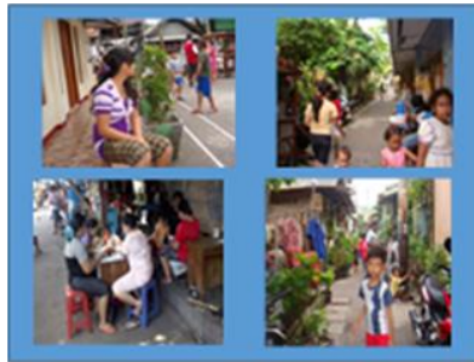
Figure 2. Several activities took place in the corridors of the urban kampong

As can be seen in Figure 2, the role of the community in the formation of the creative economy on the small road is based on the creativity of the residents and culture, the apparatus there without any interference from the government or other elements.