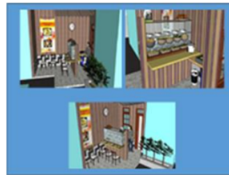
Figure 4. Before rearranging the business space Figure 5. After rearranging the business space