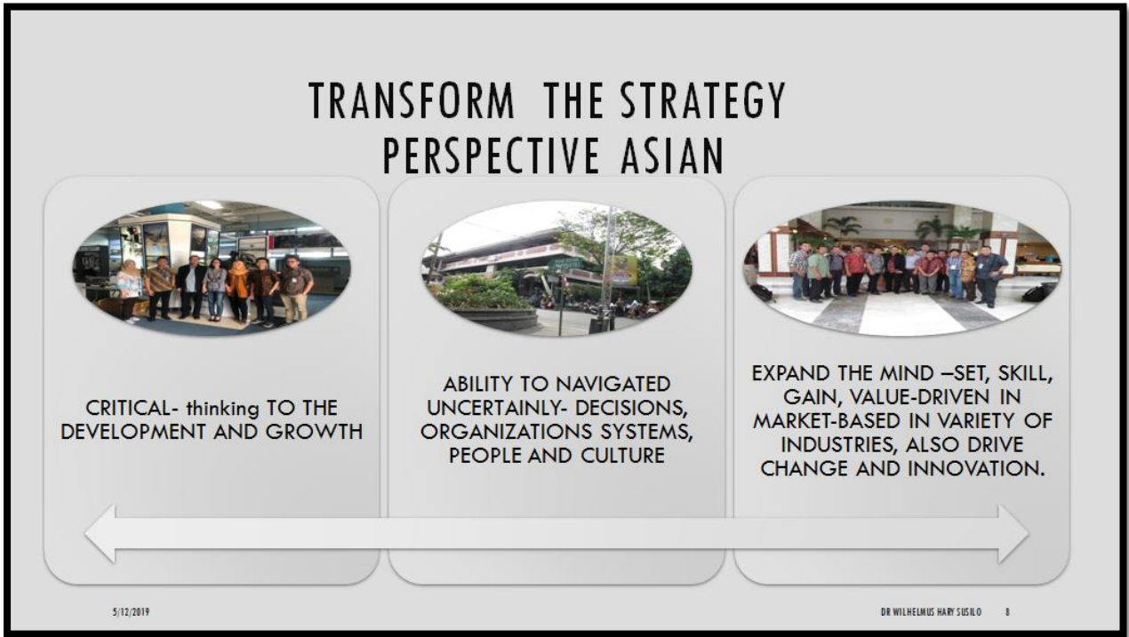
Figure 2. The Transform of the Strategy Perspective Asian