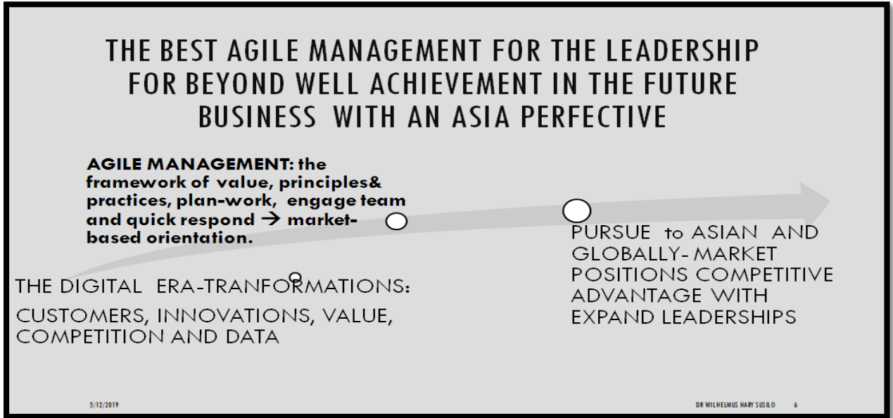
Figure 1. The Best Agile Management for the Leadership

Actually, for anticipated the paradigms in future market, the model that will assist companies to improve plans for the future marketplace. The scholars should be present a new concept, "edited platforms," as a consumer aware, but company driven, and the product development- model,conducted the empirical models for attain the organizations aims with best solutions in market-based management.