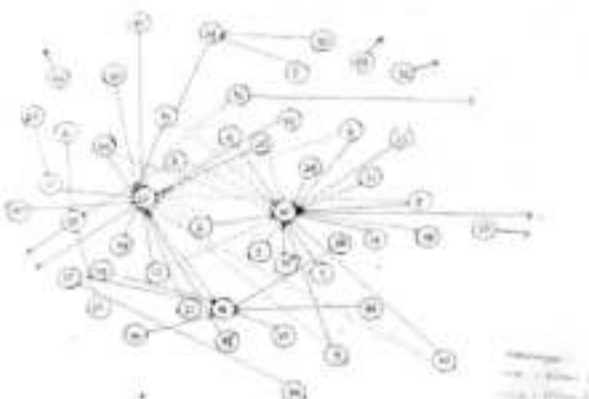
Figure 2. Communication Network Model in PNPM Perkotaan Program Kelurahan Kenari, 2013