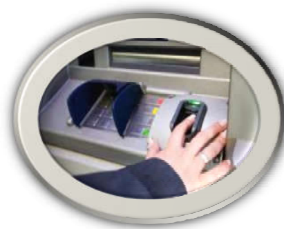
Figure 1 The private bank ATM with fingerprint security

Jimenez, & Martin, 2009; Li, Zheng, & Zhuang, 2017; Medlin & Törnroos, 2015). Thus, cyber criminals are very easy to enter and commit crimes. The way that Bank can improve its security system can apply the Biometric security system in the banking world. Biometrics is a computerized method that uses aspects of biology, especially the unique characteristics possessed by humans. Unique physiological characteristics that can be used such as fingerprints, retina of the eye, or face sensors. Moreover, these three things are present in the human body but are always different for each person, so that it can be used as a code for identification. For example, in dealing with ATMs, in addition to using a PIN, you can also use a fingerprint scanner and face sensors and retinal sensors in each ATM machine so that it can reduce ATM burglary. (Rocha Flores & Ekstedt, 2016)