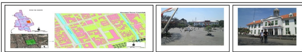
Figure 1, The situation of the Park area of Taman Fatahillah

The old town has many historic relics is high. One of the important elements and has historical value is public open space that should be protected as historic spaces as well as the economic impact of space and accommodate the life for the sake of the community. According to Kostof [1] the presence of public open space can become a witness of human needs change from time to time to rediscover physical facts in the city of its community. Public open space should be freely accessible and utilized by everyone and it contains elements of human activity, Carr [2]. New entrepreneurial ventures are recognized as key drivers of economic development for that area of public open space [3]. The physical condition of the open space and buildings of cultural heritage, environmental the Fatahillah still can be found as evidence of the development of the city's past. Evidence of the development of the city can be called a historical city blue-print of Jakarta, with its physical manifestation in the form of buildings, the river/canal and road network pattern, there are physical relics or high value buildings can be seen in Figure 1.