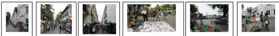
Figure 3, Small entrepreneurial ventures along Pintu Besar Utara street