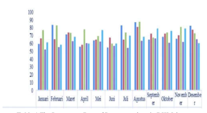
\textbf{Table 1} \ \textbf{The Percentage-Data of Room-numbers in DKI-Jakarta}

performance. (Cooper & Sommer, 2016; Lindsjørn, Sjøberg, Dingsøyr, Bergersen, & Dybå, 2016)