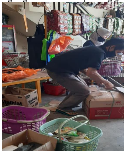
Figure 2. ‘No Plastic Bag’ Packing in Traditional Stall (personal documentation)

The two-year run of the Botak Campaign, based on observations and interviews, has made mothers feel "just plain" carrying their own shopping bags. Slowly getting used to and no longer bothered by the necessity. However, these housewives have not yet done bringing their own shopping bags to stalls or traditional markets. According to my observation, many of traditional stall also enforces plastic diet policies. They also provide shopping bags and boxes for packing groceries.