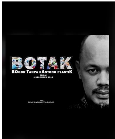
Figure 1. The ‘Bald’ Mayor of Bogor supporting Botak Campaign

also be measured the adoption of eco-innovation that is owned by the message producer so that it can be ascertained that the message is not mistaken. So, this Botak Campaign is an implementation of the concept of eco-innovation in the form of policies. The innovation itself is the use of shopping bags not made of plastic so that it can play a role in reducing plastic waste pollution, especially in waters. The concept of diffusion of innovation implemented in this study is the figure of Bima Arya as a drafter and also, almost as a symbol of this campaign itself. The Mayor of Bogor used his entire figure, his personal branding, for this campaign, including by shaving his hair to identify himself with the term Botak (bald) as his campaign jargon, on his personal account.