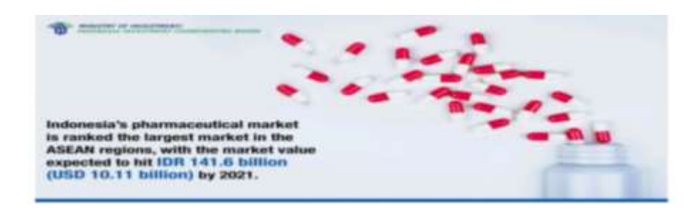
Figure 1. The Pharmacy Industries within domestics- Indonesia