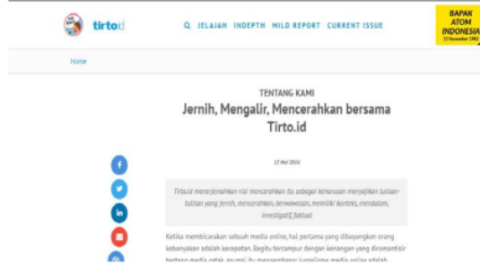
Figure 1: The History of Tirto.id

uses such approach because it wants to emphasize the analysis of existing data through data triangulation. According to Sugiyo (2009: 15), this method is a method in which the researcher is a core instrument while data collection is purposive and data analysis is inductive or qualitative in which qualitative research results emphasize more meaning than generalization.