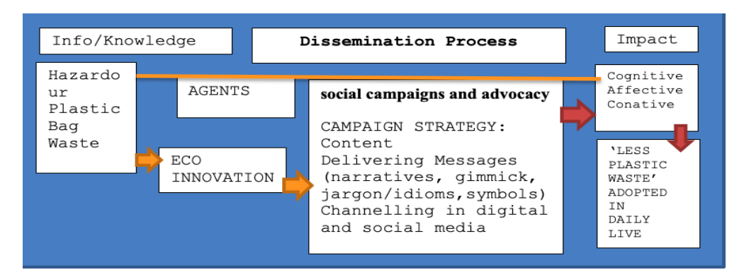
Figure 3. Diagram 1 Environmental Communication Model from Botak Campaign Pattern

This Botak Campaign strategy can be formed as a model for environmental communication. This can be seen in a research regarding the effect of exposure to news of marine animals dying from plastic waste and the zero-waste campaign on the behaviour of reducing the use of plastic bags [19]. Furthermore, the hypothesis test results of the effect of zero waste campaign exposure on the behaviour of reducing the use of plastic bags show that there is a significant effect with a positive regression coefficient, which means that the higher the exposure to the zero-waste campaign, the higher the behaviour of reducing the use of plastic bags. We suggested design model for environmental communication.