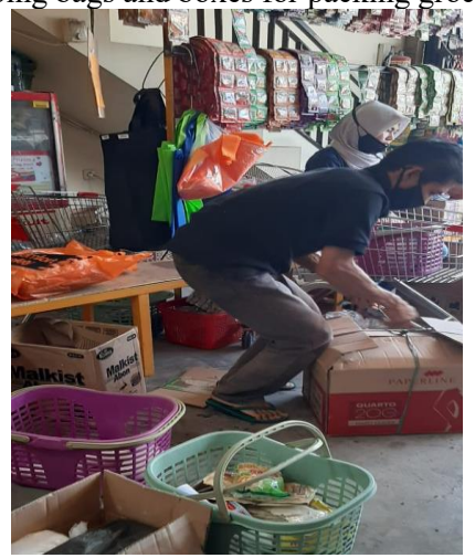
Figure 2. 'No Plastic Bag' Packing in Traditional Stall (personal documentation) 4.3 Environmental Communication Model

The two-year run of the Botak Campaign, based on observations and interviews, has made mothers feel "just plain" carrying their own shopping bags. Slowly getting used to and no longer bothered by the necessity. However, these housewives have not yet done bringing their own shopping bags to stalls or traditional markets. According to my observation, many of traditional stall also enforces plastic diet policies. They also provide shopping bags and boxes for packing groceries.