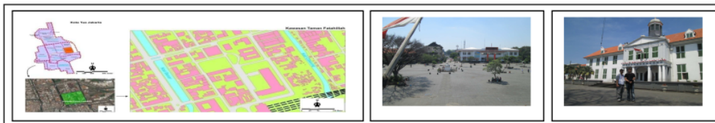
Figure 1 , The situation of the Park area of Taman Fatahillah

The old town has many historic relics is high. One of the important elements and has historical value is public open space that should be protected as historic spaces as well as the economic impact of space and accommodate the life for the sake of the community. According to Kostof [1] the presence of public open space can become a witness of human needs change from time to time to rediscover physical facts in the city of its community. Public open space should be freely accessible and utilized by everyone and it contains elements of human activity, Carr [2]. New entrepreneurial ventures are recognized as key drivers of economic development for that area of public open space [3]. The physical condition of the open space and buildings of cultural heritage, environmental the Fatahillah still can be found as evidence of the development of the city's past. Evidence of the development of the city can be called a historical city blue-print of Jakarta, with its physical manifestation in the form of buildings, the river/canal and road network pattern, there are physical relics or high value buildings can be seen in Figure 1.