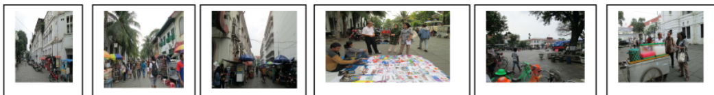
Figure 3, Small entrepreneurial ventures along Pintu Besar Utara street