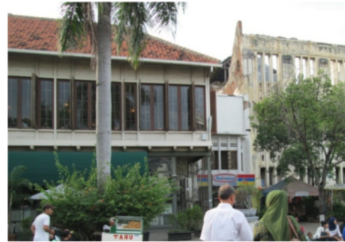
Figure 5. Batavia Cafe

revitalization in the development of the Old Town area of Jakarta is the economic and social revitalization.