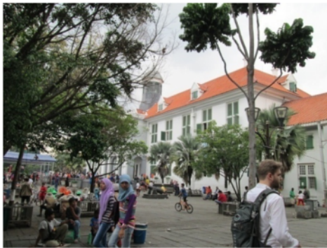
Figure 4. History Museum or known as Fatahillah Museum

Regulations on the protection of historic elements must be accompanied by liveliness in reviving the area, for example with office activities, restaurants and exhibition activities (Suwantoro, 2011). Efforts to revive economic functions and activities in a historic area that is identical with a quiet, intangible and creepy atmosphere must be eliminated and can be turned into a zone with a vibrant, comfortable, and more sustainable urban living atmosphere.