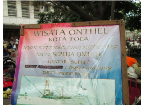
Figure 3. One of social activities within Fatahillah square that has been shown with poster

This fact shows that the management and maintenance activities are only carried out collectively and are monumental. While the community personally do not have access to participate in improving the quality of public open space.