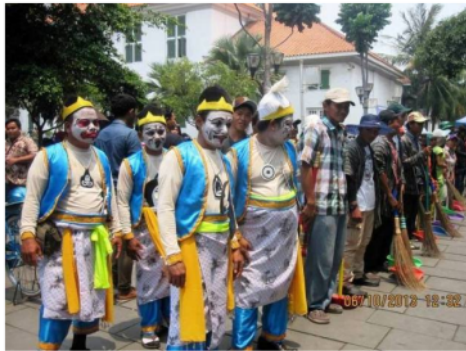
Figure 6. One of the attraction within Fatahillah Square is the existence of Punakawan, the character of Javanese Wayang

Increasing the type and frequency of activities in the open space of the Fatahillah Zone can be done along with the timing. According to Lynch (1981) activity in space is closely related to the time of procurement activities. Timing activities need to be done with attention to special times such as working hours, weekends, holidays and so forth. Activity time must be arranged to avoid the use of space that is only used at certain times and not exploited in a very long time.