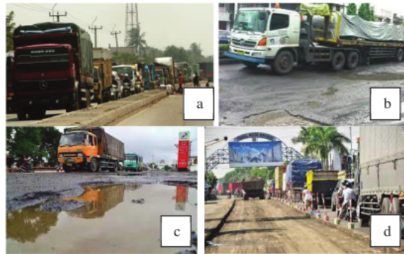
Fig. 2. Condition of Pantura Lane Roads with (a) Heavy Traffic (b) Excess Load (c) Road Damages (d) Routine Maintenance Yearly

In Indonesia, routine maintenance of roads is almost always done by way of self-governance. In most other countries, routine maintenance is done through a contract with another party, as applied to toll road Indonesia. Given the state of the road, in addition to necessary technical maintenance of roads, more importantly, is a road management, where it covers more comprehensive activities including technical maintenance, the contract method used, management strategies relating to the legal aspects, rules and regulations as well as institutional aspects.