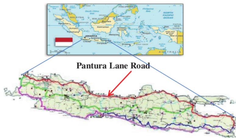
Fig. 1. Pantura Lane Road in Java Island, Indonesia