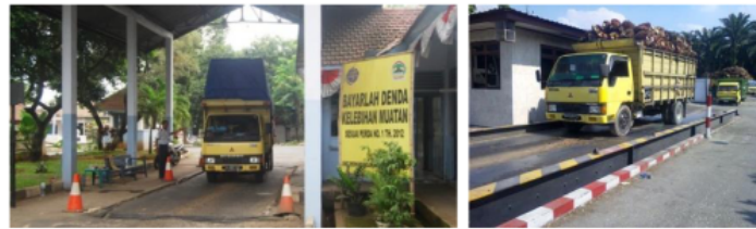
Fig. 4. Control vehicle load by weighbridge