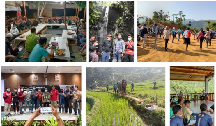
Figure 3. Various Sentul Community Local Guide Activities

carried out by the Sentul Community Local Guide is to optimize the potential while maintaining the wealth of existing resources in Desa Karang Tengah to achieve mutual prosperity.