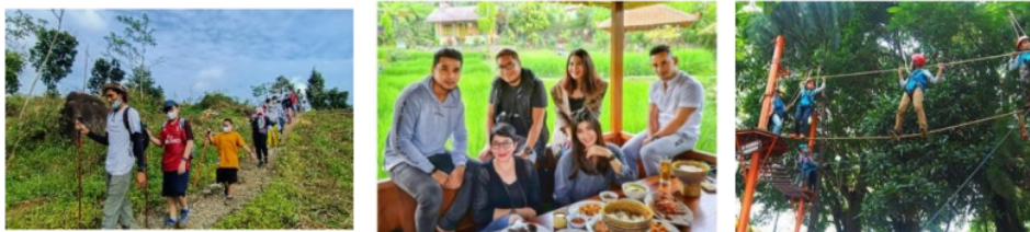
Figure 1. Various Outdoor Tours in Sentul

Figure 1 represents four types of outdoor tourism in Sentul. Trekking tourism includes adventure tourism which offers various choices of trekking paths for potential tourists, ranging from walking along gardens, rice fields, forests, and rivers to waterfalls or waterfalls as a point of interest for the trip. Tours in the form of staycations and culinary tours are also tours that do not lose a lot of visitors. Various resorts supported by restaurants and cafes are mushrooming in the Sentul area. Some only offer culinary tours while enjoying the natural scenery. Game tours, such as at the Cultural Park, provide various types of games, ranging from outbound to trampoline.