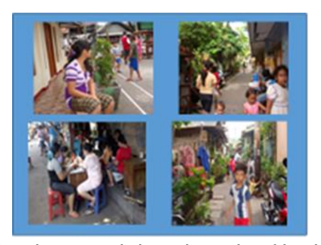
Figure 2. Several activities took place in the corridors of the urban kampong

As can be seen in Figure 2, the role of the community in the formation of the creative economy on the small road is based on the creativity of the residents and culture, the apparatus there without any interference from the government or other elements.