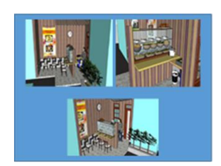
Figure 4. Before rearranging the business space Figure 5. After rearranging the business space