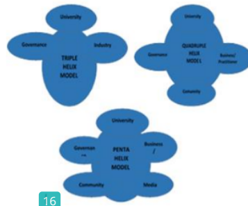
16 Figure 1. Model of Triple Helix, Quadruple Helix, and Penta Helix

According to the Triple Helix model, innovation is driven by mutual interactions and collaborations among the three helices. Academic institutions generate new knowledge through research and education, the industry applies this knowledge to develop new products and services, and the government provides the framework and support for these activities to take place.