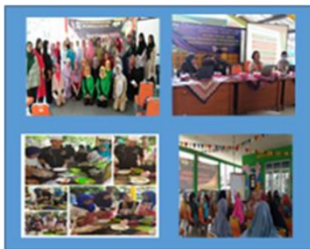
Figure 3. Implementation of Integrated Entrepreneurship Program

This activity is beneficial for low-income communities in 1 urban Kampong in the Paseban area of Central Jakarta; limited knowledge, capital, and infrastructure can be minimized through the Integrated Entrepreneurship Program (PKT). The collaboration of all parties can support the one-stop program that has been socialized by PTSP as an agency created by the Regional Government of DKI. This activity is expected to meet the targets that have been made and can be achieved through a continuous coaching process with monitoring and evaluation that already uses a system so that all supporting and inhibiting elements can be optimally detected.